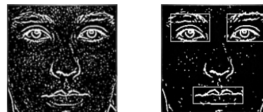
Fig. 2. Left: Edge detection results for the 7x7 laplacian of gaussian filter. Right: Edge detection results for the 7x7 laplacian of gaussian filter and the 3x3 medium filter

The filters are used to conform and reinforce these positions. The filters are applied only inside the face regions detected by the FDNN. The first filter applied is the Laplacian of Gaussian, to smooth and detect the edges of the facial features. A large kernel (e.g. 15x15) used with this filter produces very good edge detection but the computation time rises exponential with the size of the kernel. After several experiments, a trade-off kernel of 7x7 was employed. Fig. 2 shows the results of this filter using a 7x7 kernel. All the edges are extracted as shown.