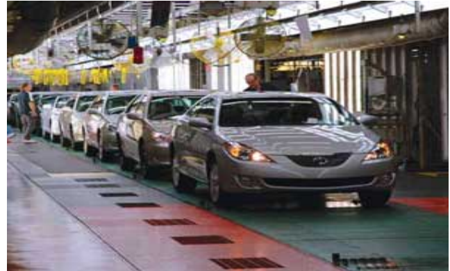
Fig 1 Showing a Lean Manufacturing Assembly Line at one of the Toyota plants

Authors are with Department of school of Engineering, University of Portsmouth Anglesea Road, Portsmouth PO1 3DJ, United Kingdom (email: Said.Azzam@port.ac.uk, laura.arias@myport.ac.uk, Shikun.Zhou@port.ac.uk)