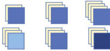
Fig. 4 Examples of Exhibition Nodes

Upper: Nodes of different size (determined by number of resources) Lower: Nodes of different popularity (determined by the user visits)