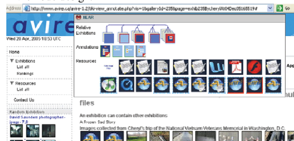
Fig. 1 Screenshot of the NEAR panel in A•VI•RE.

due to the limited capacity of human's visual working memory [3], we only provide 3~4 variations for each attribute in the node design.