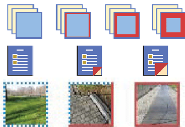
Fig. 9 Examples of Nodes with Different Visit Statuses.

Figure 8 shows an instance of how NEAR is working in A•VI•RE. In the figure, when the cursor is over a resource, two exhibitions and two annotations are highlighted with red borders. The screenshot shows us a lot of useful information: which exhibition(s) sharing this resource (two in the screenshot, one is the current exhibition, and the other is a small and never-visited exhibition) and which annotations have quoted this resource (one default annotation with a lot of resources quoted and one un-default annotation with a few resources and text). Cursor-over also shows some property information of this resource such as resource ID, name, contributor and comments. Similar things happen when the cursor is over an exhibition or an annotation. When the cursor is over an exhibition, all the resources it shares and annotations under it would be highlighted. When the cursor is over an annotation, all resources it quote and exhibitions it belongs to would be highlighted.