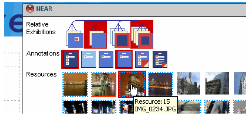
Fig. 8 Screenshot of NEAR panel (when the cursor is on a resource).

“Brushing” [22] is adopted in NEAR interaction to enable visual linking of components of heterogeneous complex objects. When the mouse cursor brushes over a data element, the user can find more relations between data elements and read the description of the element. Sometime people like to move mouse when they read. To avoid flicking, the users can click on an element to freeze the relation view and read the relationships between elements. A mouse click on empty space will clear the frozen view and re-activate the mouse-over effect. Similar to any desktop applications, double clicking will forward the background page to display the full content of the element, and the panel will refresh and show the relations in the new situation.