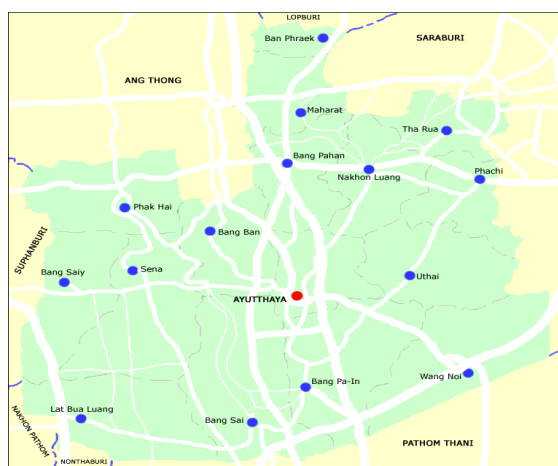
Fig. 1 Bangsaiy Municipality [10]

Bangsaiy Municipality was selected as the study area. It is one of 34 municipalities in Ayutthaya province and located western from the center of province. In the municipality area, there are 19 villages situated in three sub-districts which are Bangsaiy, Taolao and Kaewfah. In Bangsaiy, Taolao, Kaewfah subdistricts, there are 4, 9 and 6 villages (Moo) respectively. The area of the municipality is 5.5km 2 or 3437.5 Rai. A map showing location of Bangsaiy district is illustrated in Fig. 1.