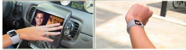
Fig. 7: Concept C usage scenario

movies presenting the new concept shoot and a new evaluation of the device acceptance made.