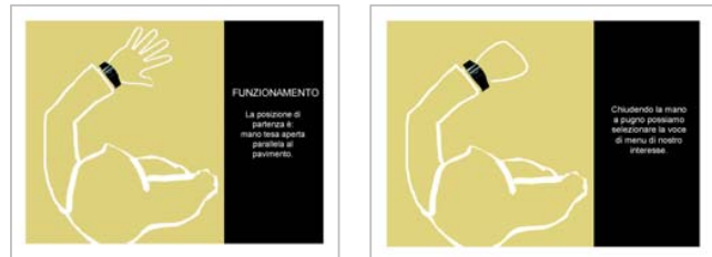
Fig. 6: click/selection through hand closure

To confirm the selection of a menu option the user has just to close the hand starting from an initial position with the open hand so selecting the preferred item (fig.6).