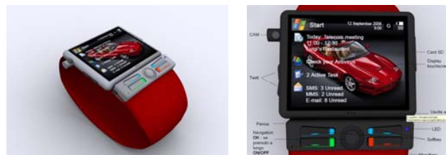
Fig. 2: Concept B

The definition of these prototypes has allowed us, through the 3D modeling, to see how certain technological requirements for this project could have been translated into reality, but especially provided us with material for a first round of device acceptance with the target users, in order to enter into the users co-design phase.