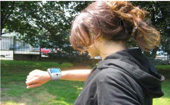
Fig. 4: Concept A usage scenario

To get the material to be submitted to the users, specific scenarios have been built for each Persona. Scenarios are essentially stories about the characters and what they do in their daily life [5] having a plot that marks actions and events. They can encourage reflection during the process of design but especially are very flexible and can be quickly revised according to change in design needs [4]. The Personas, which are used as round characters within them, may focus the attention of the designer on the desires and needs rather than on the mere actions, helping in the designing of future services where there are no specific "a priori" requirements defined [18, 19].