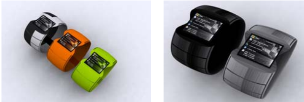
Fig. 8: different personalization of Concept C

Thinking this new concept we had also to take into account what was a third key requirement of the users that is not making your communication patterns more complicated with the introduction of two items instead of one. We had so to think about a concept that integrated the headset in the wrist phone, detachable when necessary (i.e. incoming calls) but part of it and not requiring a separate recharge manner (fig.9).