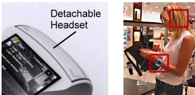
Fig. 9: the integrated/detachable headset

Thinking this new concept we had also to take into account what was a third key requirement of the users that is not making your communication patterns more complicated with the introduction of two items instead of one. We had so to think about a concept that integrated the headset in the wrist phone, detachable when necessary (i.e. incoming calls) but part of it and not requiring a separate recharge manner (fig.9).