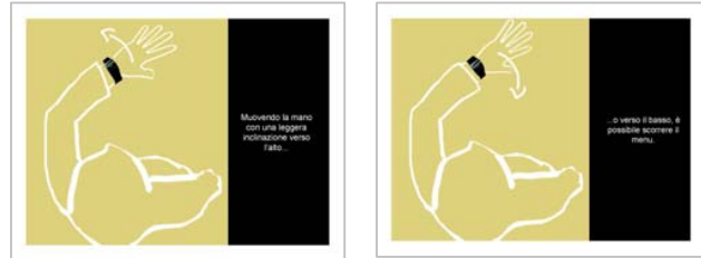
Fig. 5: scrolling through wrist rotation

Moving the hand with a slight tilt upward or downward, the user can scroll through the vertical menus (fig.5).