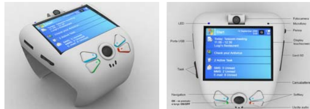
Fig. 1: Concept A