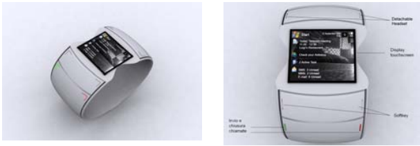
Fig. 7: Concept C