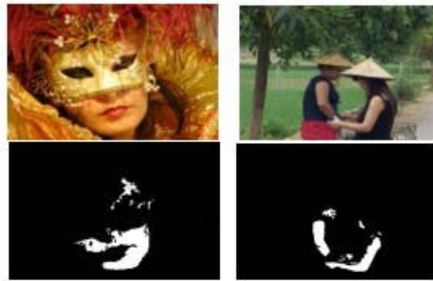
Fig 3. Skin detection for two images of the category "People".

We use images from the category "Society" composed of images with people. The algorithm uses 5 conditions applied on R,G,B (normalized) components [10].