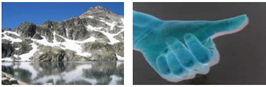
Fig 1. Two images from CLIC. Left: an original image from the kernel ("Mountain" class); right: a transformed image (negative transformation) in the testbed