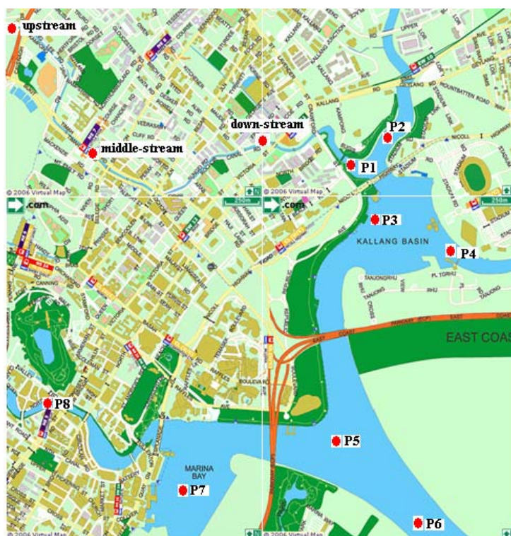
Fig. 1 Map of the sampling areas showing sampling sites