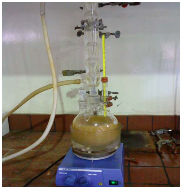
Fig. 2 Biodiesel production in the laboratory

traces impurities. The esterification process was carried out in 1000 ml screw-capped bottles. Preheated oil was firstly poured into the bottles following by MeOH and H_2SO_4 . The bottles were immersed in mantel at designed temperature, stirrer and time. Operating parameters for esterification process for methanolysis of rapeseed oil were 1.8 % H_2SO_4 as catalyst, MeOH/oil of molar ratio 2: 0.1 and reaction temperature 62 °C, for a period of 3h. The yield of methyl ester was > 90 % in 1 h (Fig. 2).