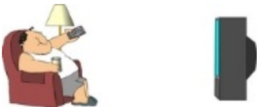
Fig. 3 People want to be relaxed when watching TV

Elderly people usually have very limited experience with technology, and therefore, a considerable tradeoff between simplicity and functionality is highly required. The system must have easy to use interface with simple navigation patterns and minimal rarely-used functions. Complex interactions must be avoided for easy performance of the desired actions [12]. As shown in Figure 3, people intentionally want to be relaxed and comfortable when watching TV. Thus, any difficulty in using the device will be a barrier to its acceptance.