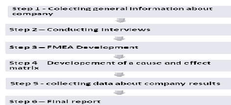
Fig. 1 Methodology steps

In following sections, all the steps of the methodology are described in detail. If the diagnosis is made by an entity external to the company, steps 1, 2 and 6 can be simplified.