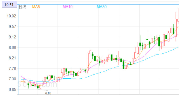
Fig. 3 The Stock Price of Company X3

In a word, dynamic fuzzy clustering analysis of real estate companies is with good precision above, and it's valuable to grasp the investment opportunity and so on.