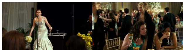
Fig 11 A friend appearing as a bride (left) and the divorced friend attending the wedding reception (right)

This is a case of Western wedding culture contrary to Eastern wedding culture based on Confucian thought that taboos divorce.