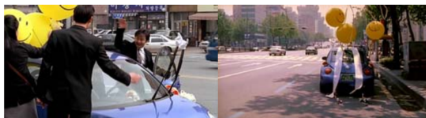
Fig 5 Jeongmin leaving for a honeymoon (left) and the rear of Jeongmin's wedding car (right)

The friends decorate the bumper of the car for the honeymoon tour with tin cans connected by string or write messages on the car using a lipstick. These practices are also Western wedding culture announcing that they are newly married couple [11]. We can see such western traditions in Jeongmin's wedding car.