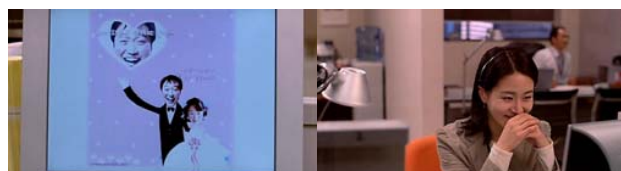
Fig. 2 E-invitation card sent by a male client (left) and Hyojin happy with the client's wedding (right)

after the meeting. The client invites using an email (e-invitation card) instead of sending a traditional invitation card according to Eastern proprieties. The simple and convenient invitation may be considered an example of remediation resulting from the mixture of invitation card, a traditional medium, and the advance of sociality, culturality and technology.