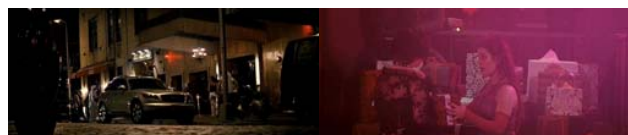
Fig 14 A party on the eve of wedding (left) and the bride receiving gifts (right)

What is more, different from Eastern wedding where congratulatory money is collected on the wedding day, Western wedding receives gifts or congratulatory money necessary for 'Bridal Shower' around a month before the wedding ceremony.