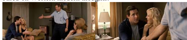
Fig 15 George meeting Tess' father (left) and George shaking hands with Tess' father (right)

Tess invites George home in order to introduce him to her father. A friendly mood is created as the father expresses his thanks to George and shakes hand with him for giving a job to Jane and marrying Tess. The two families meet each other on an equal position rather than on hierarchical human relation based on Western modern thoughts.