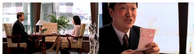
Fig 1 A male client expressing a negative opinion on divorce (left) and reciting Xiaojing and Lunyu (right)