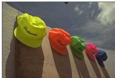
Fig. 1 Original Image of 'hats.jpg'

Fig. 1 represents the original 'hats.jpg' image, while the Fig. 2 represents reconstructed image when chrominance blue is downsampled by the factor 2. Fig. 2 also shows that compression ratio 26.5066 is achieved with the peak signal to noise ratio is 32.9300 & the root mean square error is 5.7549.