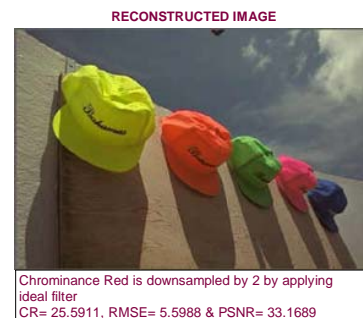
Fig. 3 Reconstructed Image in case of downsampling the Cr by 2

Fig. 3 represents the reconstructed image when chrominance red is downsampled by the factor 2. Fig. 3 also indicates that compression ratio of 25.5911 is achieved with the peak signal to noise ratio is 33.1689 & the root mean square error is 5.5988.