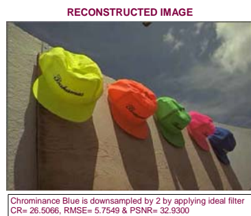
Fig. 2 Reconstructed Image in case of downsampling the Cb by 2