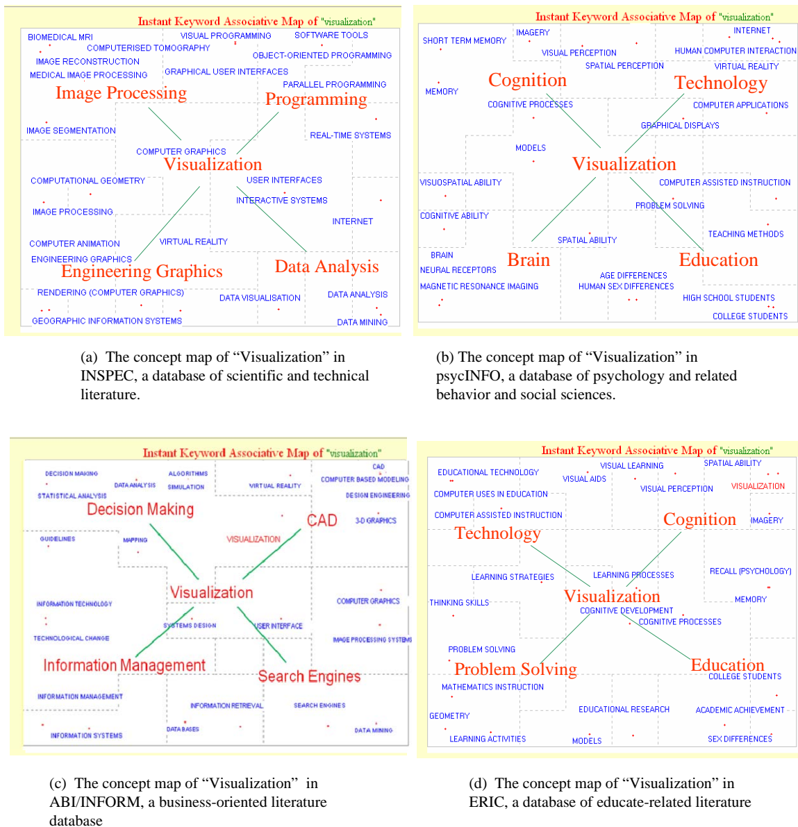
Fig. 3 Mapping the same concept in different domains