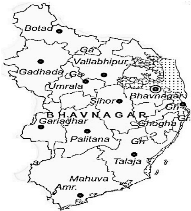
Fig. 1 Location of the study area

Bhavnagar is a peninsular district of South-Eastern Gujarat. It covers an area of over 8334 km 2 . There are close to 800 villages in this district. Geographical location of Bhavnagar district is 21° 28' N (Latitude) and 74° 52' E (Longitude). The main resources of irrigation in these areas are wells and rivers.