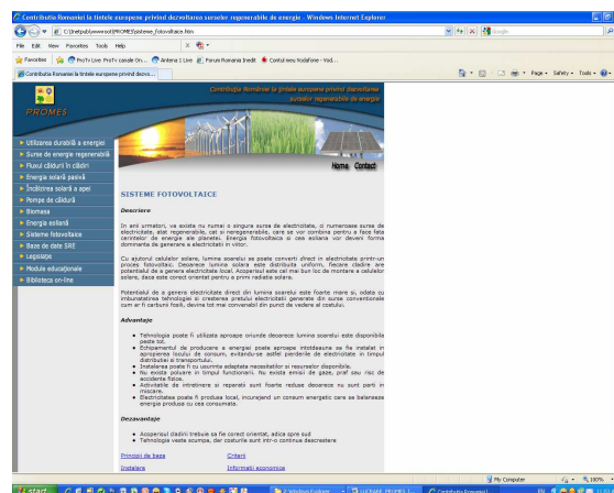
Fig. 2 – PV Systems

A module section covers the following topics: heat loss, passive solar techniques, solar water heating, heat pumps, biomass for heating, wind energy, and photovoltaic cells (Fig. 2).