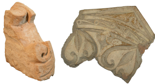
Fig. 3 Ornamented brick and ornamented clap board

one corner of the overlapping bricks is 20x20 sm, thickness is 4 cm. According to its degree of angle, it is clear that it forms one angle of a six-sided geometrical pattern. The surface of the incised exterior brick is about for 0,5-1,2 cm. This type of incised decoration was found on a brick fragment [10] found at room N 11 during the excavations conducted in Saray complex located at the centre of the medieval city in 1977 and also on a clay brick at the Burana mausoleum N 1 [11], dating to the X–XII century. G.A. Pugachenkova noted that constructions with incised decorated bricks and decorative mortar, as well as interlocking or overlapping bricks was characteristic of North Turkestan monuments [12].