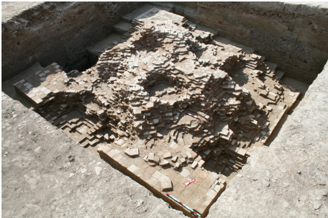
Fig. 1 The view of the minaret basis from the East

In order to discover the corners and other walls of this building, the excavation block was expanded to an area of 10,4x10,3m. Consequently the ruins of the minaret building dating to the XI-XII centuries was discovered. The minaret consists of two parts: the foundation or base (stylobate) and the upper part (socle) (see Fig. 1, 2).