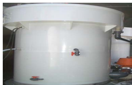
Fig. 4 Electrolytic reactor

The activities in this laboratory can be technologically characterized in the following categories: determine the number of KTJ bacteria, cyanobacteria, and pathogenic elements, determine the characteristics of water chemistry, measuring of quantitative characteristics of undesirable substances in water, measuring the adhesion of organic flatters on the collectors, determine the ways of treating the organic fleet. All these activities / stations give also a place for education of students, especially those on the second and third stage of university studies. On the figure 4 we can see already purchased equipment which serve for the activities mentioned above.