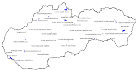
Fig. 1 An overview of the largest water basin in Slovakia connected to the cyanobacteria occurrence in the growing season