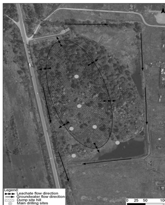
Fig. 2 Kleisti Dump Site (Nr. 1 in Fig. 1) Location of drilling sites, leachate and groundwater flow directions

Electromagnetic data was collected and interpreted in order to plan drilling and sampling sites for evaluation of contamination in soil and groundwater. Drilling works were done with Fraste „Terra - in” and “Iveco” drilling machines. The auger drilling method has been chosen, and boreholes 1-12 m of depth were drilled, including those done through the waste [13]. Temporary monitoring wells were input in sites around and on the dump hill sites. Groundwater sampling and further analysis of possible contamination parameters were done. Surface waters, sediments from ditches were sampled in closest area around these two dump sites on indicative parameters. The odor testing was done for the air sampled from the waste massif, in order to quantify the possible smell emissions while works of re-cultivation would be done. Emissions and gases were calculated based on the U.S. Environmental Protection Agency developed model LandGEM (Landfill Gas Emission Model - Version 3.02.) [14].