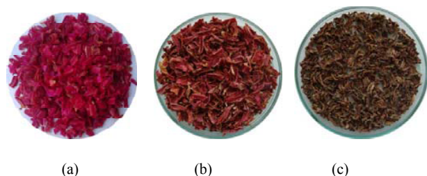
Fig. 3 Example of o dragon fruit peel; a) fresh peel b) drying at 110 °C c) sun drying

The dried peel with the high initial moisture content was dried until the moisture content reach to about 10% prior to analyze. The data obtained from different drying method is shown in Table II. The results found that the sun drying method give a lowest value for antioxidant activity, \beta -carotene and betalains contents.