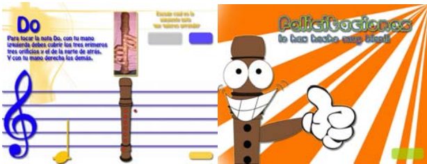
Fig. 3 Images from the software application for the Virtual Flute

The Fig.2 shows two of the ten children who have played the flute and have learnt the basic musical notes