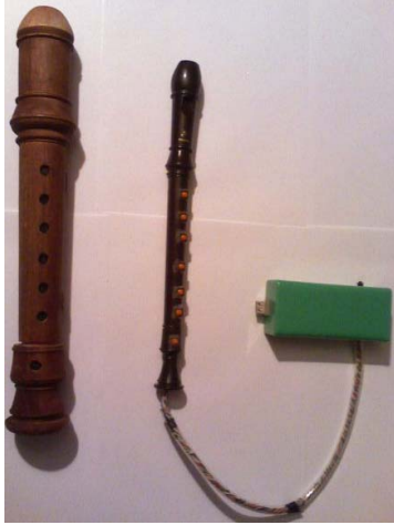
Fig. 1 Virtual Flute

The figure above shows the two designed flutes the one in the left is a own model in which the electronic components are inside. The other one in the right is a traditional flute and the electronic components are in the little green box next to it.