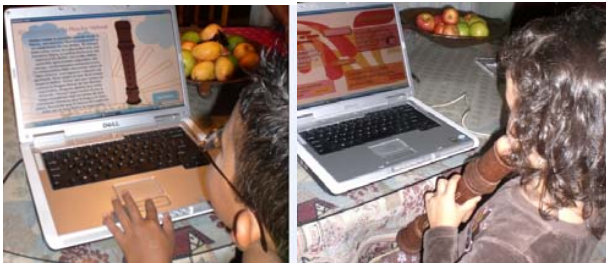
Fig. 2 Children playing the Virtual Flute

The figure above shows the two designed flutes the one in the left is a own model in which the electronic components are inside. The other one in the right is a traditional flute and the electronic components are in the little green box next to it.