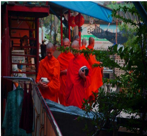
Fig. 3 Morning culture