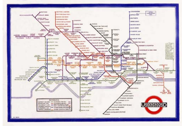
Fig. 3 London Underground Map

Even taking into consideration the high degree of complexity of this scheme, Design is able to deal with this complexity organizing it in such a way to make it clear for the final users. By doing so, the Designs' systemic approach will be able to contribute to different goals in several different contexts. Thus, society is taken: