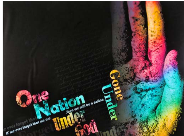
Fig. 2 "One Nation" poster design by an Iranian student

"I would like to thank our dear dean for his support and also for all of our lectures in foundation. We have learned a lot from you and it was a very special year for us. Everybody did a great job and we are proud to be FCM students" .