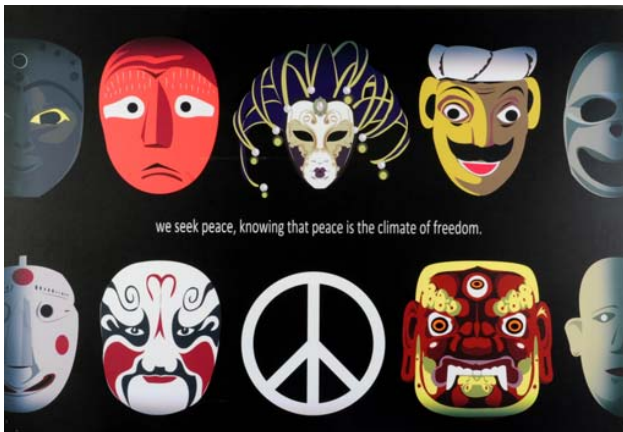
Fig. 1 "One Nation" poster design by a Malaysian student

An exhibition entitled "One Nation" was showcased to local and international viewers consisting of the general public, professionals, academics, artists and students. The exhibition challenges students to explore new creative avenues and refine their skills to the highest levels and serves as an inspiration to improve further. The exhibition is a selection of some 30 posters, on the theme or title of One Nation, created by Arts and Design students. The class which exhibited the posters was composed of students of various nationalities. There were Bangladeshis, Chinese, Indians, Indonesians, Iranians, Iraqis, Nigerians, Saudi Arabians, etceteras as well as Malaysians.