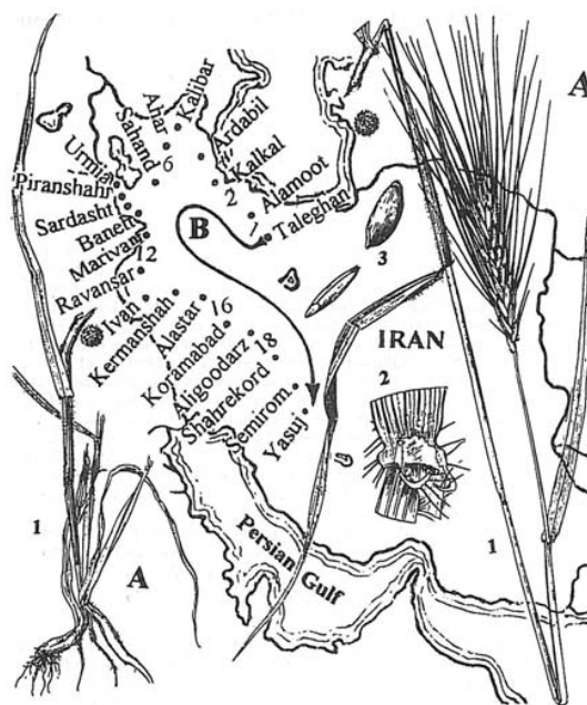
Fig. 1 The path and areas where the plant was studied in Iran

Through the paths from Taleghan (located on the Northwest of Iran; habitat N° 1) to Yasuj (located on the west of Iran; habitat N° 100) one hundred habitats (populations) of the T. boeoticum , selected and marked (Fig. 1). According to the climatograms, these habitats were ordinated from cold to very cold; always in boundaries between arid to humid areas [10].