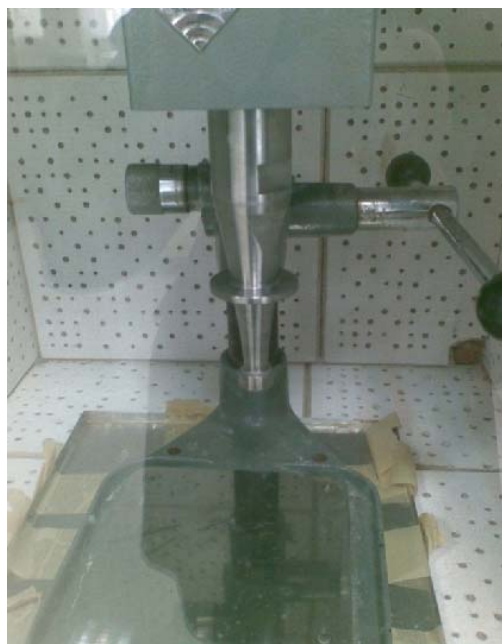
Fig. 1 Sonicator device