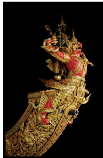
Fig. 2 The Royal Barge Narai Song Suban Ratchakan Thi Kao

Recently of the figurehead either Royal Barge and Royal Yacht were launched in the beginning of Rattanakosin Era for example; The Krabi Prab Muang Marn Barge, The Krut Hern Hed How Barge and The Krut Tret Traichak Barge. Only the body of each barge was rebuilt and was kept at Wasukri Pier which also includes The Royal Barge Narai Song Suban that constructed in the reign of King Rama III and launched on his Garuda in the reign of King Rama IV. In year 1996 which was the fiftieth anniversary of Bhumibol Adulyadej's accession to the throne, the King Rama IX was mandated to launch the new one of The Royal Barge Narai Song Suban by using the original figurehead. However, the original figurehead was excessively heavily therefore, The Royal Barge Narai Song Suban was rebuilt and renaming to "The Royal Barge Narai Song Suban Ratchakan Thi Kao" [5]-[9].