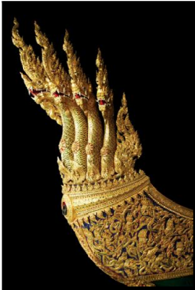
Fig. 4 The Royal Barge Anantanakkharat

According to the previous paragraph that mentioned about the historical and the important of Royal Barges and its arts which have been created specially, the figurehead, which is the heart of the barges. The figurehead is the combination and identity of the beauty of Thai arts. Therefore, the researcher brought its structures, colors and the decorations of the figurehead of four Royal Barges to leads to the inspiration of costumes design for this project [10].