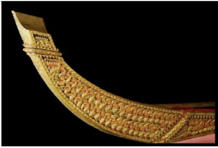
Fig. 3 The Royal Barge Anekkachatphuchong

According to the previous paragraph that mentioned about the historical and the important of Royal Barges and its arts which have been created specially, the figurehead, which is the heart of the barges. The figurehead is the combination and identity of the beauty of Thai arts. Therefore, the researcher brought its structures, colors and the decorations of the figurehead of four Royal Barges to leads to the inspiration of costumes design for this project [10].