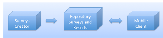
Fig. 1 Initial Block Diagram

The first architecture outlined is illustrated in Fig. 1 below.