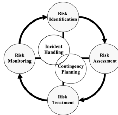
Fig. 1 Cyclic risk management process considering contingency planning [3]

Fig. 1 shows a risk management process applied by Norrman and Jansson [3] which consider the contingency planning and reactive incident handling within the frame of the process.