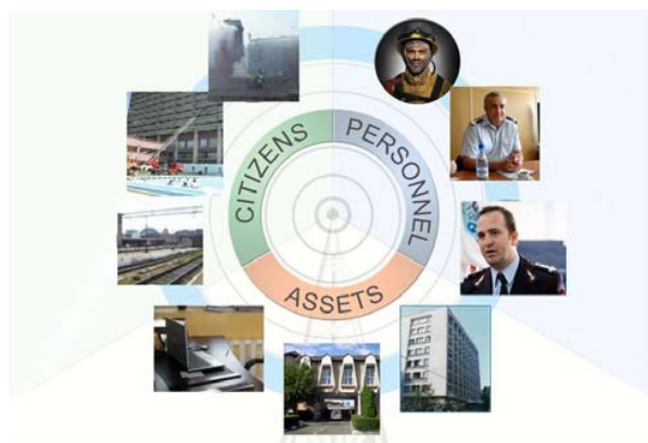
Fig. 1b. The evacuation concept

Relying on the Dutch model, the evacuees were directed the evacuees reception center - ERC which was organized in a sport hall. This solution was chosen because there are buildings of this type in many urban or even rural locations, which allow the temporary sheltering of a great number of people and the playing area can be easily organized into specific areas. At the same time, the vestibules and other annexed spaces can have specific purposes, such as: resting areas for pregnant women, a medical office or “mother and child” rooms (Figure 2).