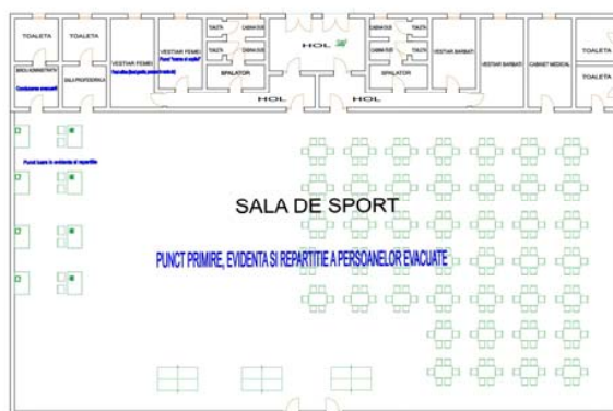
Fig. 2 .The way a sport hall have been organised to

The general architecture of the integrated decision support system for emergency management has been detailed in [6] and showed on the Figure 3.