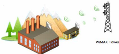
Fig. 1 The WiMAX system scenario for Solid Propellant Rocket Production

The ammunition-manufacturing site is usually situated in the remote area that considered low casualty. The suitable site is usually near the mountains or earth mounds so they act as a blast barrier, blocking the explosion in the case of accident. In most cases, the data link between each plants is required in order to remotely control the machine in hazardous area or access explosion proof security network camera. In solid propellant rocket production, the connection from the office center to several plants can be simply established by deploying WiMAX. A point-to-multipoint WiMAX tower can rapidly create secure high-speed connectivity among plants which overcomes the difficulty of wiring fiber optics in mountainous region (see Figure 1).