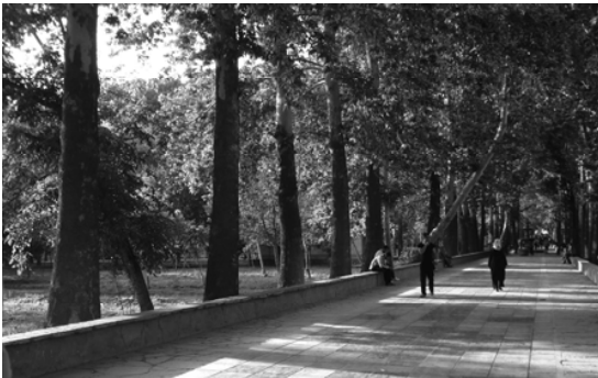
Fig. 3 Walkways of Jahanshahr residents in Fateh Garden