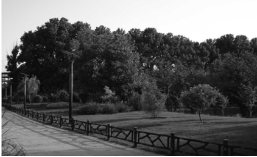
Fig. 5 Fateh Garden as one of the most important landmarks of Jahanshahr Neighborhood