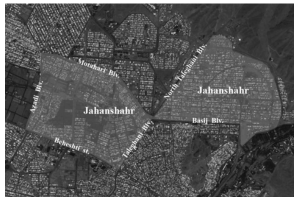
Fig. 2 Location of Jahanshahr neighborhood