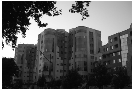
Fig. 4 High rise buildings in Jahanshahr Neighborhood

What is raised as serious warning and concern in Jahanshahr Neighborhood is tolerable capacity of neighborhood. This neighborhood has reached to the threshold of population and construction capacities and has no capacity for physical development (Fig. 4). If continuous monitoring as an important principle is ignored, principles and criteria that have guaranteed the neighborhood sustainability will be eliminated. Due to increasing the population, main streets of neighborhood have a high traffic volume in some day hours, but unfortunately urban management authorities have destroyed the gardens and widened the streets to solve this problem. It caused destruction of resources capacity and natural characteristics of neighborhood.