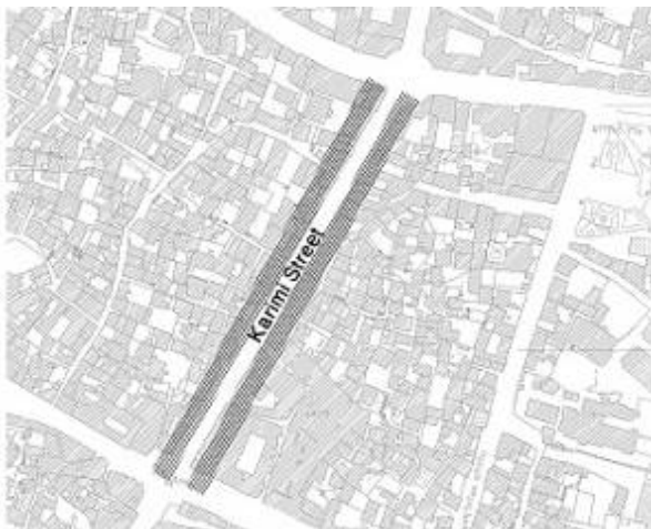
Fig. 2 Karimi street Located in Lahijan historical area