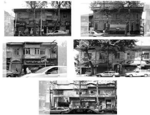
Fig. 3 Historical building facades with highest mean

*Correlation is significant at the 0.05 level (2-tailed)