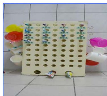
Fig. 1 Tool-kit holder

(E) Tool-kit holder acts as a reliable instrument to help rebuilding the mental-ill patients' memory of tooth-brushing habit, shown as the figure I.