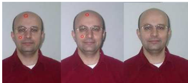
Fig. 3. A video sequence with changing lighting condition.

compared to their correspondences in the last frame in the sequence given in frame 3. Four small regions have been