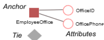
Fig. 1 Visual representation of anchor model's components