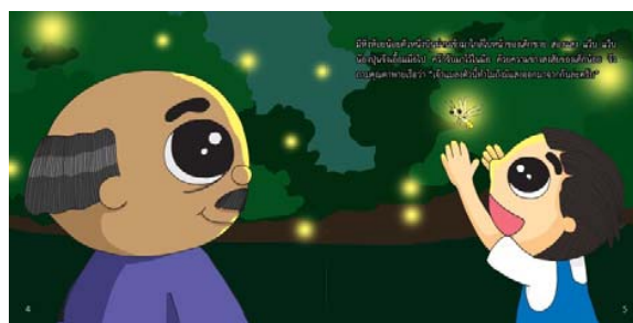
Fig. 4 Pictures in pages 4-5

“A little firefly comes close to Poon’s face blinking light. The boy catches it with his hand. Puzzling, he asks the old man, “Why is light coming out from this insect’s abdomen, Grandpa?”