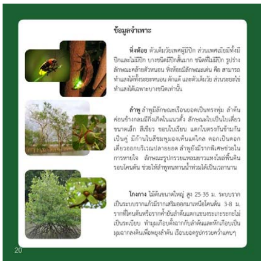
Fig. 12 Page 20: Specific Information

Tale 3: Phya Firefly fell for the daughter of Phya Lumphu (cork tree). So Phya Firefly brought his partisan fireflies over to ask for Phya Lumphu’s permission to marry his daughter. To impress Phya Lumphu, Phya Firefly decorated the cork tree with lights from the partisan fireflies