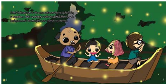
Fig. 3 Pictures in pages 2-3

8 visual images which were later applied to 1 illustrated children’s book.