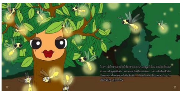
Fig. 8 Pictures in pages 12-13

“It is a beautiful wonder that can endlessly inspire imagination for everyone. Therefore, we need to protect the nature so it can stay with us for a long time”, their daddy says. Pang and Poon smile. Then Poon opens his fit and lets the firefly fly back to his friends at the cork trees. The light from the firefly is blinking beautifully.”