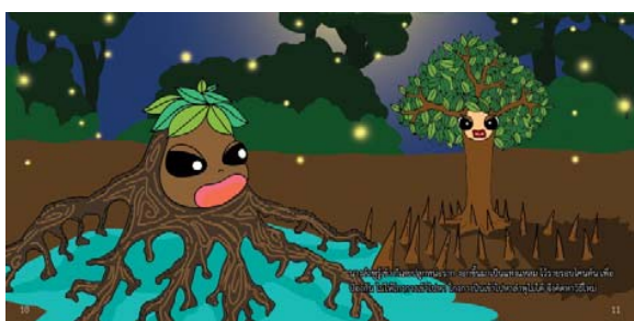
Fig. 7 Pictures in pages 10-11

“The story was fun, Grandpa. “Pang and Poon say simultaneously. The old man then says, “There are lots of fun stories like this one as long as we still have the nature – rivers, canals, trees and beautiful lights of these fireflies.”