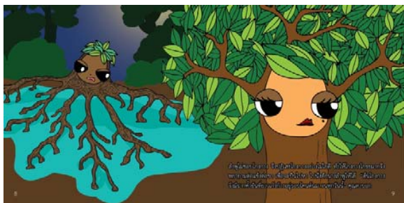
Fig. 6 Pictures in pages 8-9

“The cork tree did not love the mangrove and indifferently refused him. The mangrove got very angry so he grew his roots in an attempt to climb to sit on the lap of the cork tree. That is why mangroves have long roots coming out of their trunks to support them.” The old man says.”