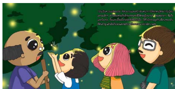
Fig. 10 Pictures in pages 16-17

“The cork tree knew what the mangrove tried to do so she grew her roots into pointed sticks on the ground around her to prevent the mangrove to come to her. The mangrove could not come to the cork tree so he found a new way.”