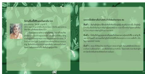
Fig. 11 Pages 18-19: Inspiration

“The mangrove asked fireflies to fetch the cork tree for him. A lot of fireflies then flocked around the cork tree and tried very hard to pull her out but still they could not pull the cork tree out because they were very small. They pulled and pulled... until lights came out of their abdomens. And they still try until today.”