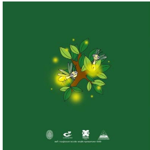
Fig. 13 The Back Cover

Kongkang: Mangroves are big trees of the height of 22-35 meters. They have a taproot with aerial roots coming out of their trunks, 3–8 meters above ground. Aerial roots grow disorderly and nearly orthogonally with the trunk and then bend orthogonally again to the ground to support the trunk. The top of the tree has the up-side down narrow cone shape.”