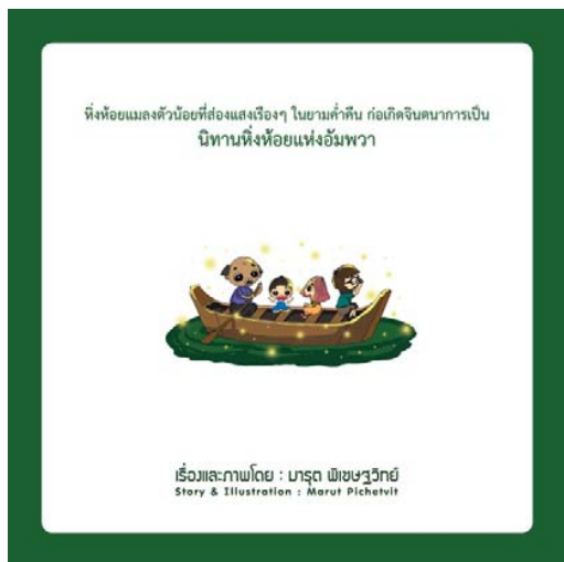
Fig. 2 Inside cover

“A little firefly comes close to Poon’s face blinking light. The boy catches it with his hand. Puzzling, he asks the old man, “Why is light coming out from this insect’s abdomen, Grandpa?”