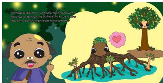
Fig. 5 Pictures in pages 6-7

“Little fireflies emitting light at night inspired imagination which led to the story of Ampawa Fireflies.”