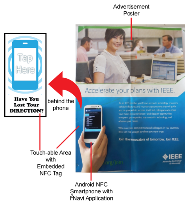
Fig. 3 Implemented I 2 Navi system

smartphones were used as read/write devices for the development of the NFC tags. A set of these NFC tags were then embedded in several existing advertisement/information posters. The NFC tags embedded posters were placed in various locations within the building. Each tag contains related location information.