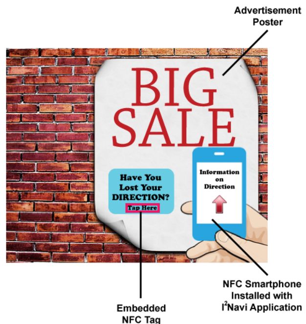
Fig. 1 Hardware components of the I 2 Navi

The I 2 NAVI uses NFC tags and an NFC enabled Android smartphone with the customized I 2 NAVI navigation application to provide a cost effective indoor navigation system, as shown in Fig. 1. Each NFC tag has a unique identifier and is used to store location information such as coordinates which is used to search for a destination point within the system. The number of tags required depends on the size and intricacy of a building. For instance, buildings with many floors and wings will need more tags for a more effective navigation. These NFC tags can be embedded in existing advertisement posters with a marked dedicated space for users to access for direction (see Fig. 1). When activated, the I 2 NAVI navigation application, installed on the Android NFC-enabled smartphone, will be able to read information such as the current location from the NFC tag and subsequently guide the user through a directed path on the floor plan via smartphone's screen to the intended destination.