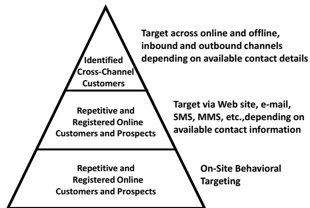
Fig 2 Actionable levels of visitor identification

The channels through which these initiatives can be executed (Web site, e-mail, offline, etc.) will depend on the level of each site visitor's registration, ranging from anonymous browsers to recognized repetitive visitors, to registered, known customers (see Fig 2).