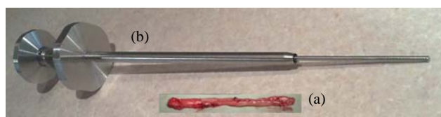
Fig. 3. (a) New fistulectomy set. (b) Excised tissue from the patient body.

After removing the device, a lumen with a small diameter approximately equal to 8 mm remained in patient body. This test showed that the new device is successfully capable of