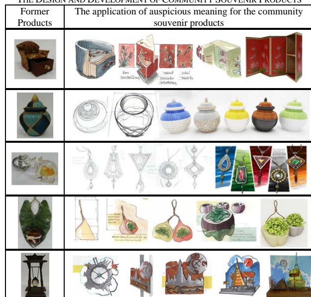
TABLE III THE DESIGN AND DEVELOPMENT OF COMMUNITY SOUVENIR PRODUCTS