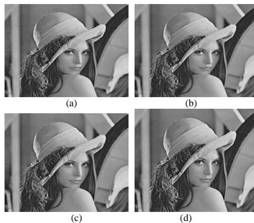
Fig. 2 The stego-images of "Lena" at the different pure payload. (a) 41.77 dB embedded with 0.5 bpp, (b) 37.92 dB embedded with 0.70 bpp, (c) 32.61 dB embedded with 1.0 bpp, and (d) 25.22 dB embedded with 1.50 bpp