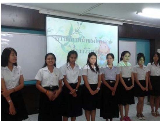
Fig. 1 Groups of students present in class

The conclusions of these results found the students had a lack of proverbs, sayings, similes, figure of speech, and metaphors. Their reading skills were limited when it came to scanning, skimming and detailed reading. When asked to repeat what they read, their interpretation and comprehension was poor. They lacked in knowledge of process of writing and categories of books. They lacked in knowledge of literary works and poems.