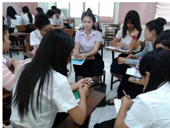
Fig. 2 Students discuss issues of reading

The conclusions of these results found the students had Problems of articulation, illiteracy, local dialects, less interest in the root of exotic language, error in Thai Grammar since childhood, and less practice.