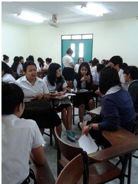
Fig. 4 Students debate issues and summarize

The conclusions of these results found the students had no knowledge of Thai poem pronunciation, no understanding of word meaning, no control of breath, no practice, no affection and faith to poem, no confidence and determination, no optimism to poem, and finally, no knowledge of social context and Thai Culture about the poems.