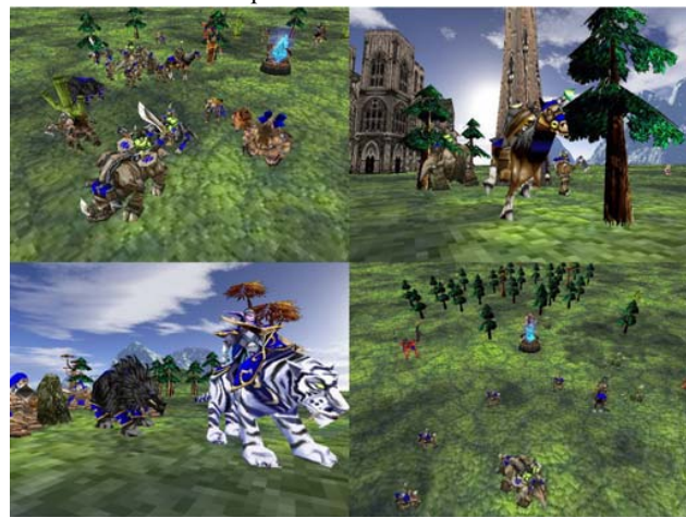
Figure 3. Screen shots from Parallel World game

A screen shot of the game is shown in Figure 3. All text, buttons, graphics and sounds in it are mental elicitations of a neural network constructed by NPL. Players might walk around, talking with other NPCs (None-player characters), complete complex tasks all in a continuous infinitely-large distributed game world. It is like browsing 3D web pages [5], however, it is more interactive, purposeful and fun. We will see later how the HCI template can be used in this framework.