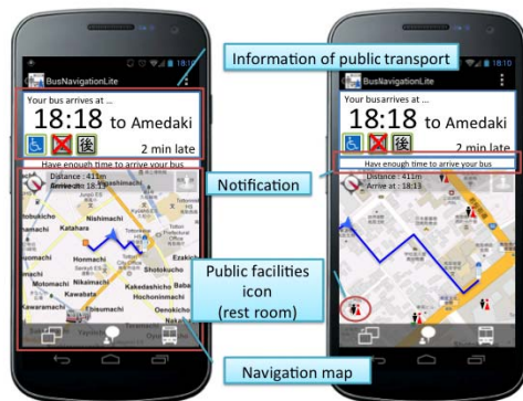
Fig. 5 Navigation on walking state

our system gives more specific information about public transport. Fig. 5 illustrates the user interface for the walking state.