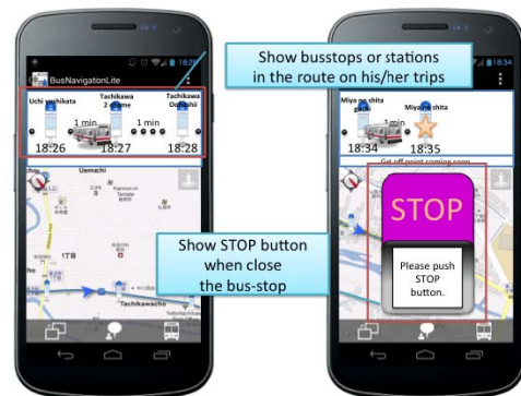
Fig. 7 Navigation on riding state

After the user ride a public transport, the navigation system goes to the riding state. On the state, the system shows a map and progress to the destination. When a passenger is arriving at the destination, the system alerts the user to get off. If he/she must transfer another transportation at that point, the system shows the way to move to the next point and information of the next transport. Figure 7 illustrates a user interface for the riding state.