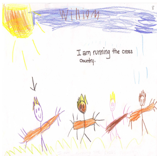
Fig. 1 Kindergarten boy picture.