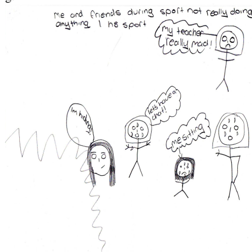
Fig. 3 Year 6 girl not participating in physical education and trying to avoid involvement

A total of 62 Year 6 students, boys (n=32); girls (n=30) participated in the study. Boys featured themselves as active participants (93.7%) with 75% including their friends in the picture. Girls provided very detailed pictures, featured themselves as active participants (73%) and most (80%) included their friends. However, it should be noted that more girls (13%) included sad faces in their drawings than did boys (3%). In comparison, more boys (28%) than girls (13%) provided non-descript facial expressions. Few students included the teacher in their pictures (9.3% of boys and 6.6% of girls). However all boys who included the teacher did not include any facial expressions, leaving them in the background, whereas all girls who included teachers in their pictures drew them with angry faces. Descriptor sentences in this age group provided more insight into the attitudes of both genders towards physical education. Some children used the picture opportunity to draw pictures that showed how they dealt with confrontation. Other children took the opportunity to write more than one sentence about their frustration at not being able to enjoy a wider range of activities and how often they would have to miss out on doing physical education. For example Figure 4 is from a young girl who is bullied because she is an active participant, yet continues because she enjoys playing.