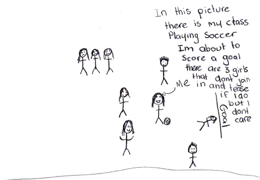
Fig. 4 Year 6 girl who is bullied by other girls if she does participate

recognise the teacher as part of the overall physical education experience, and have included them because they know they are present but do not recognise them in a leadership role.