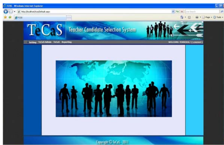
Fig. 2 Main interface for the TeCaS System