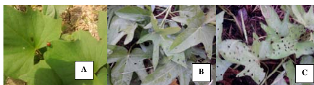
Fig. 1 Leaves area were infested <25%(A); leaves area were infested between 26 - 50%(B); leaves area were infested between 51 - 75% (C)

4 = leaves area were infested between 76 and 100%