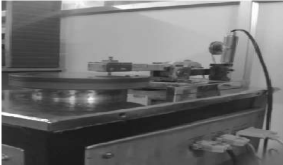
Fig. 2 Experimental Setup for Wear Testing

adjusted in accordance with ASTM G99 test standard. Wear testing was carried out in the pin on disc wear testing machine as per the standard. Fig. 2 shows the experimental setup of the wear testing machine to find out the wear value of the different DMLS components.