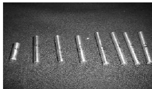
Fig. 1 DMLS Wear Testing Specimens

The 3D model of the required component is produced through Solid Works software. The file is then converted into '.stl' format and fed into the machine which automatically converts the file into '.bdf' format using RP Software. The bed surface is properly cleaned and homing is done. The process where the piston moves up and comes down in order for the new layer to be coated is called as homing. The temperature of the fabrication chamber is slightly below the melting point of the metal powder. This is to ensure that the laser beam does not require much energy in order to melt the powder. The process is done by moving the piston up and down and recoating with the powder. Eight different parts are produced for different parameters and they are taken to the EDM cutting machine [11] to remove the final test specimen from the base plate. Infiltration is done for four components where the epoxy resin is first applied on the components and then they are placed in the oven for 3 hours for the equal distribution of heat. Photograph of the wear testing DMLS sample is shown in Fig.1.