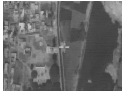
Fig. 3.1b 1 st frame in an aerial sequence