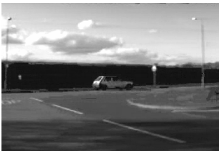
Fig. 3.2a 0 th frame in a road sequence