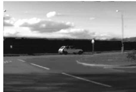
Fig. 3.2b 1 st frame in a road sequence