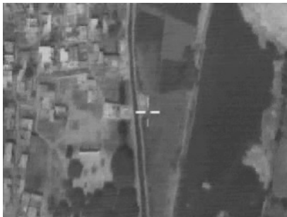
Fig. 3.1a 0 th frame in an aerial sequence